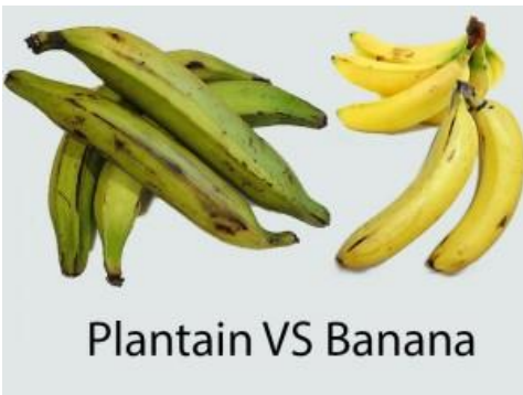
Plantain VS Banana