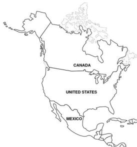
Outline Map of North America

a piece of cloth used as a symbol for a country